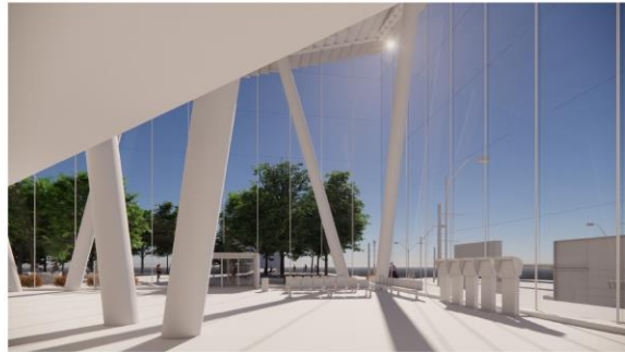
Interior views of the KCTH main atrium, credit: WZMH Architects