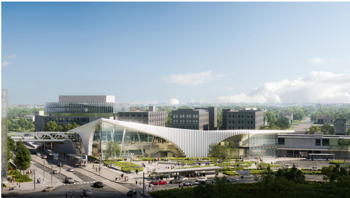
Exterior view of the future Kitchener Central Transit Hub, credit: WZMH Architects

Submission Deadline: Friday, May 15, 2026 at 5 p.m. EST