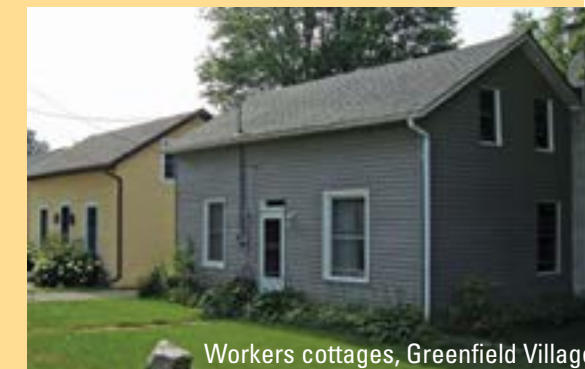
Workers cottages, Greenfield Village