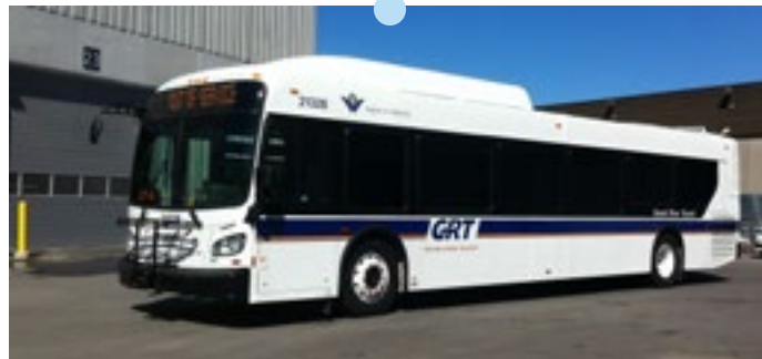
Facilities and Transit Fleet Expansion