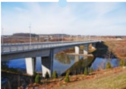
Fairway Road Extension and Bridge, Kitchener