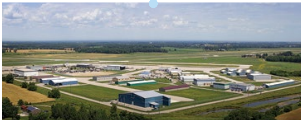
Airport Business Park Development