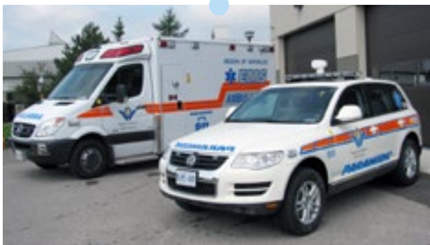
Facilities and Ambulance Fleet Expansion