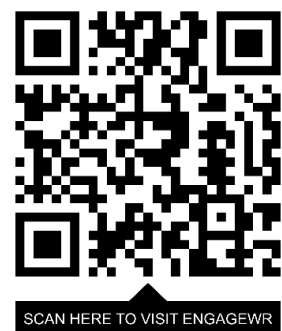
SCAN HERE TO VISIT ENGAGEWR